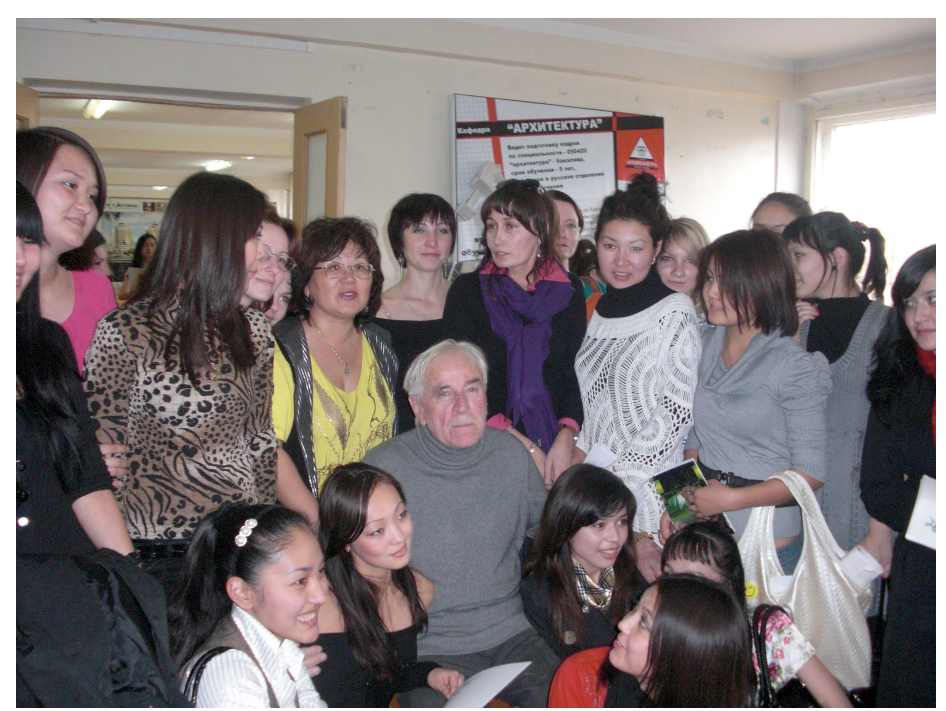
The Master and his students.....