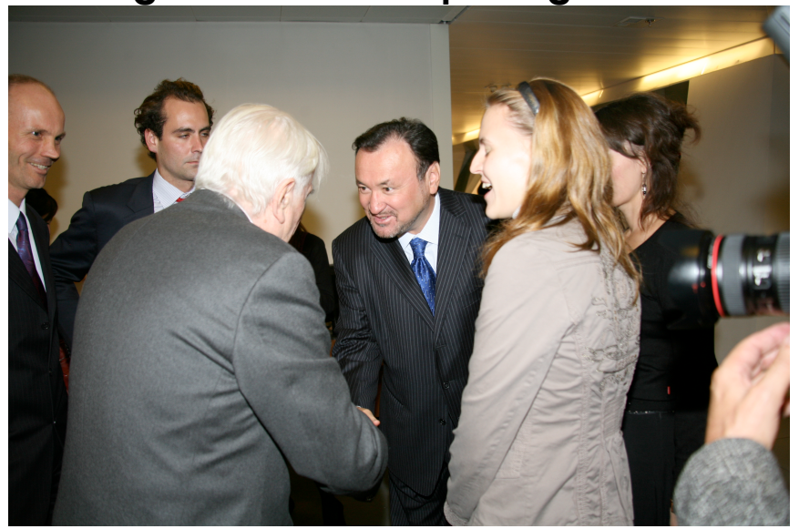
The Greetings by the Kazakh Minister of Culture, the Honorable Mr Kul-Mukhammed Mukhtar Abraruly