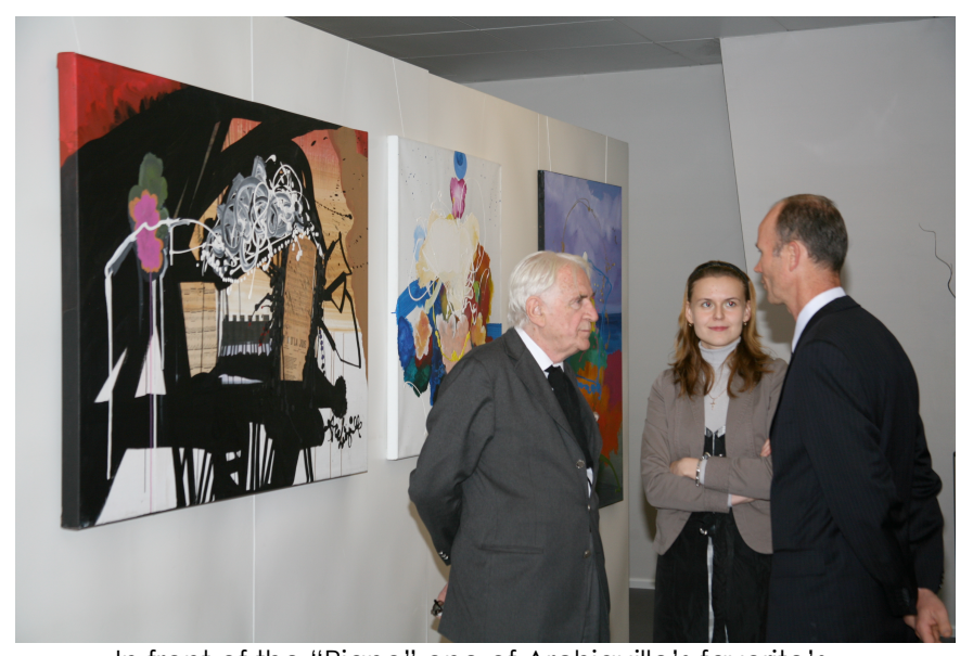
In front of the "Piano" one of Archiguille's favorite's...