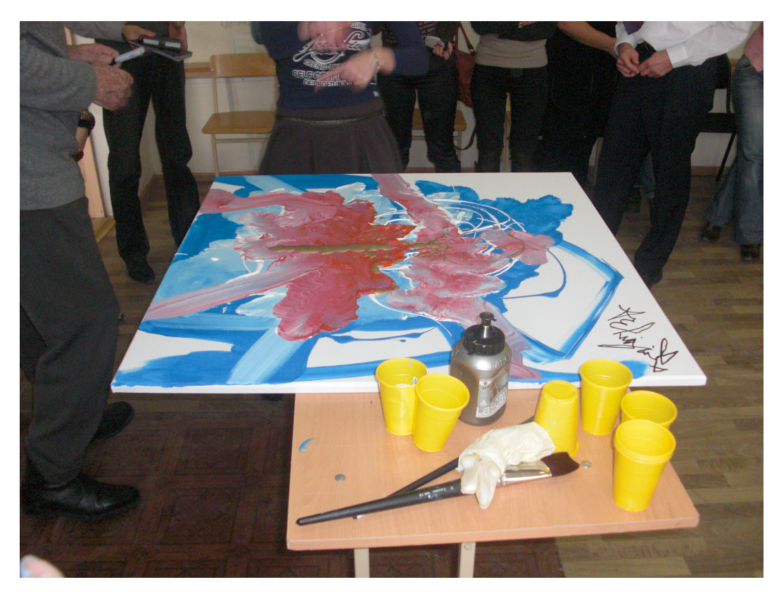
A new "Archiguille" is born, named "Butterfly"