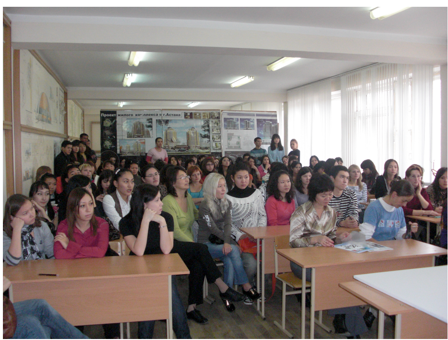
The room was overflowing with interested students that had learned about Archiguille beforehand through the Internet.