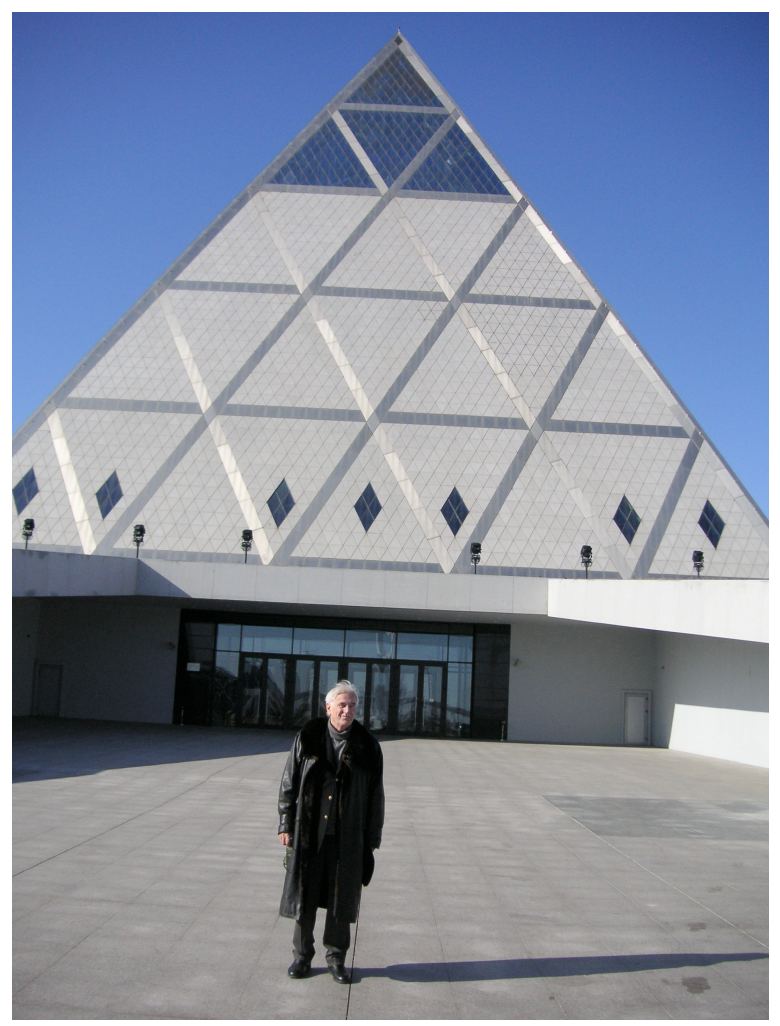
Archiguille in front of the Pyramide