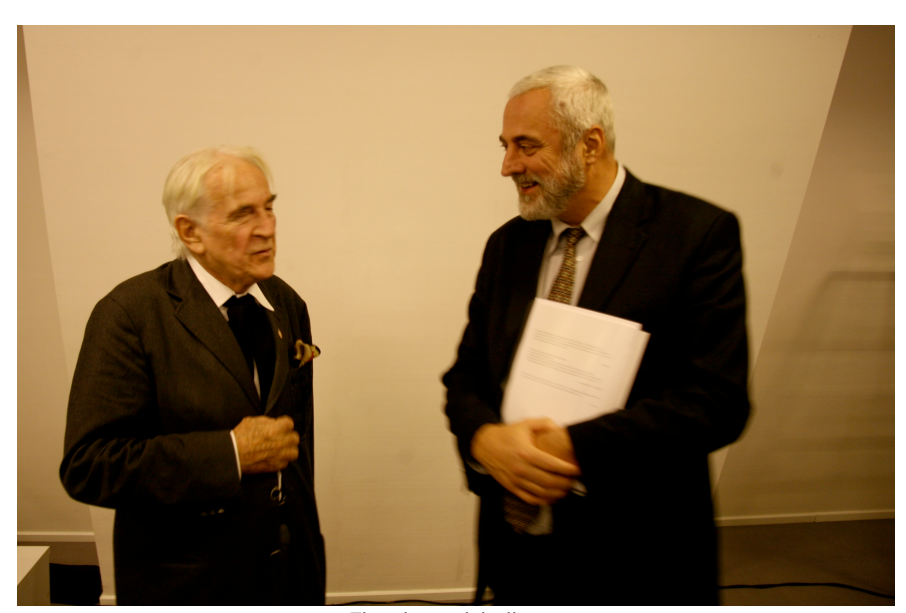
The heart talks...