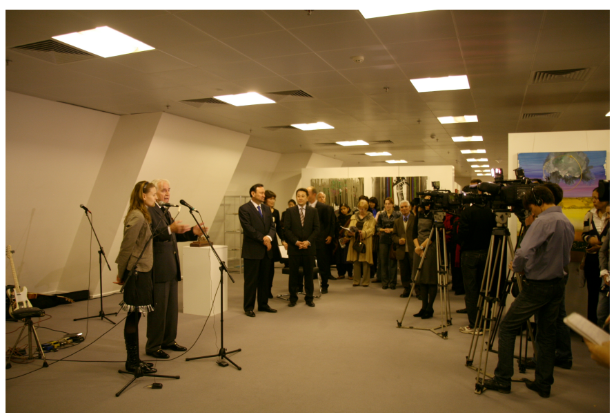
The event was well reported by both local and national Media....